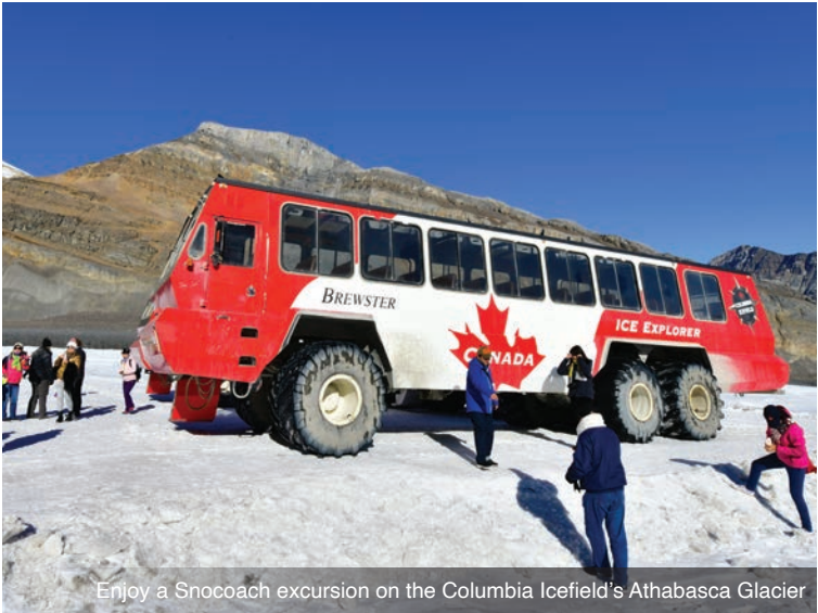
Enjoy a Snocoach excursion on the Columbia Icefield’s Athabasca Glacier