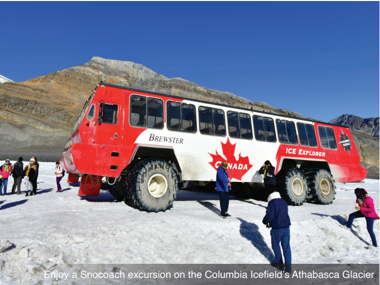
Enjoy a Snocoach excursion on the Columbia Icefield’s Athabasca Glacier

DAY 9 Travel Home: Following breakfast, a group transfer to Calgary International Airport for flights home is available. Meal: B