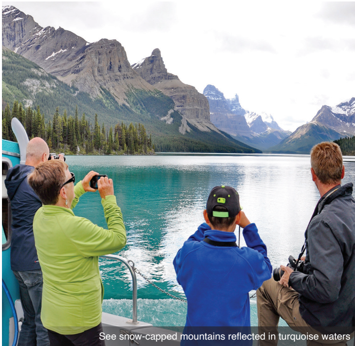
See snow-capped mountains reflected in turquoise waters