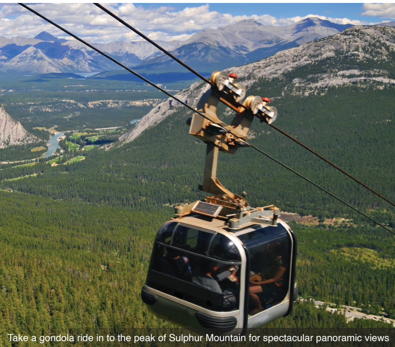
Take a gondola ride in to the peak of Sulphur Mountain for spectacular panoramic views

DAY 8 Travel the Icefields Parkway: Travel along one of the world’s most spectacular mountain highways today, the Icefields Parkway. See snow-capped mountains reflected in the turquoise lakes along the way and watch for the black bear, moose and caribou that inhabit the region. Tonight, dinner is held high atop the Calgary Tower. Meals: B, D