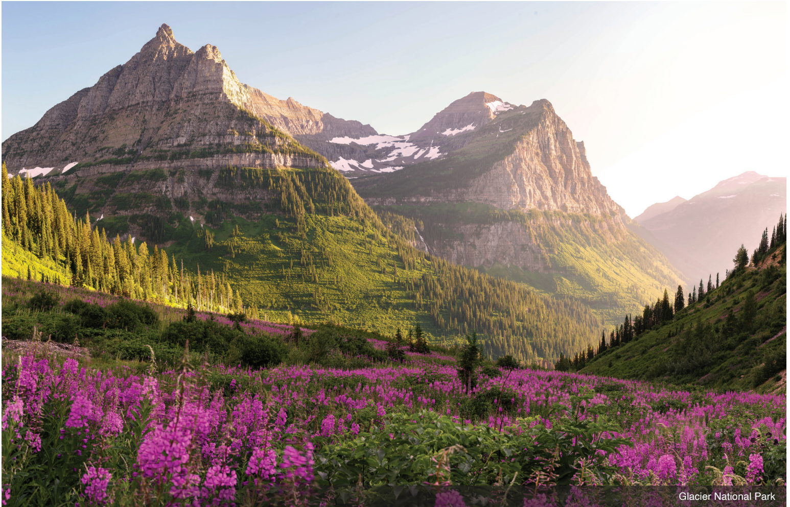
Glacier National Park