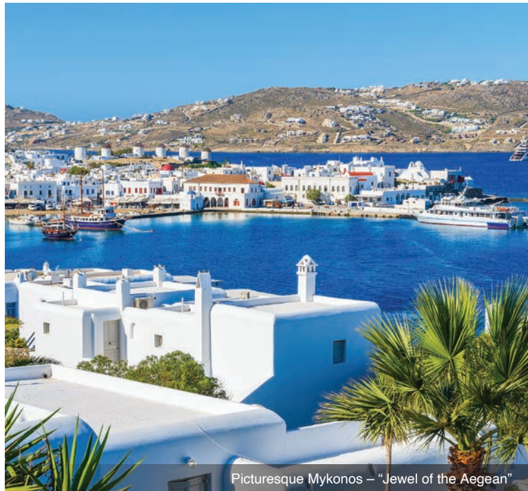
Picturesque Mykonos – “Jewel of the Aegean”

DAY 1 Depart the USA: Depart the USA on your overnight flight to Athens, Greece, a city with a history that dates back almost four millennia.