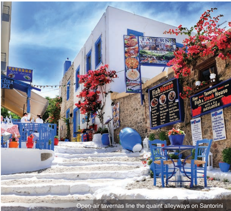
Open-air tavernas line the quaint alleyways on Santorini

with food. You'll sample the various products along with small crudites and create your own classification chart. The 'teacher' will then see how you did! After this experience, enjoy the remainder of the day at leisure. Browse in the boutiques, visit the beach or simply enjoy people-watching and meeting the locals at a sidewalk café. Meal: B