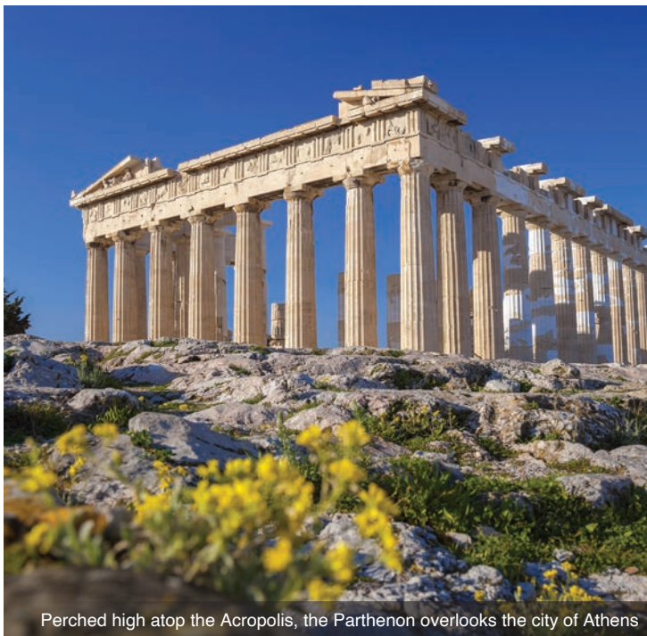
Perched high atop the Acropolis, the Parthenon overlooks the city of Athens