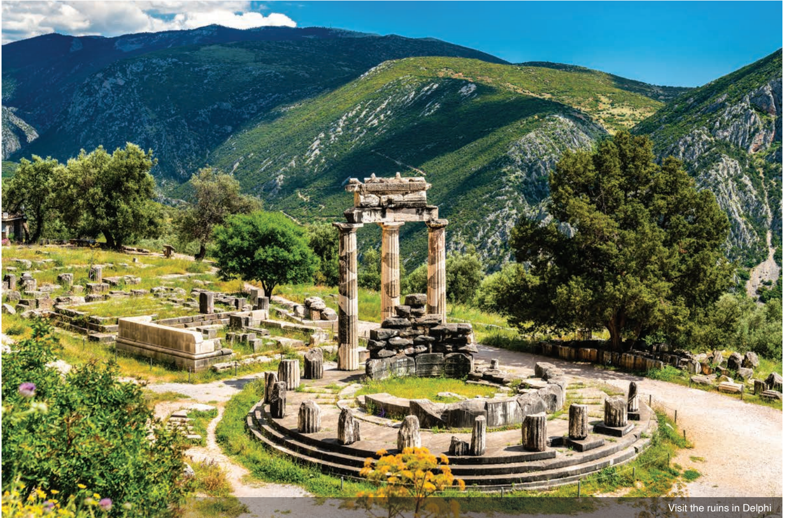
Visit the ruins in Delphi